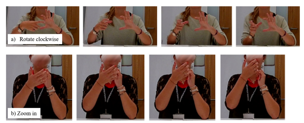
Figure 5. Examples of three-dimensional interaction