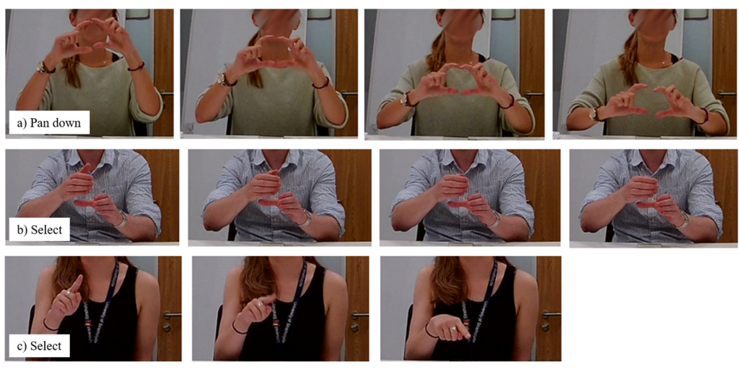
Figure 4. Examples of repeated gestures for pan down activity (a), and select activity (b and c)

For the selection and deselection of a surface, some participants used slightly different motions. F in the superscript denotes that the hand is performing a flicking motion, T that it is performing a tapping motion. Occasionally one finger or three fingers were used instead of the entire hand, but as the gestures were of the same nature, differentiation between the numbers of fingers used was not made at this stage. Although no instructions were given to the participants prior to the study, repetition in gestures between them was noticeable for most of the activities. Nine activities were most frequently performed using one type of a gesture e.g. to pan down five participants have used the gesture shown in Figure 4a. For three of the activities two different types of gestures are repeated e.g. to select a surface four participants perform the gesture shown in Figure 4b, and two participants perform the gesture shown in Figure 4c.