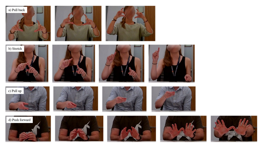
Figure 6. Examples of the zoom in gesture

There were concerns about the perception of 3D shapes shown on the 2D screen, particularly depth perception and if the interaction with the object would be more akin to that encountered in tablet or phone interaction. For example, to zoom in on a tablet or a phone a user usually slides tips of two fingers apart in a straight line, or pinches the screen. It was found that this does not seem to be an issue. The participants did not interact with it in a vertical plane the object was shown in, but instead used three-dimensional space in front of them. The majority of participants interacted with the virtual objects as if they were physical objects suspended in the air in front of them. Using the zoom example, majority of the participants "pulled" the object back to zoom (Figure 6a), while one participant used the phone screen based zoom activity (Figure 6b), one pulled the object up (Figure 6c), and one pushed it to the front (Figure 6d). This is encouraging, as it indicates that participants seem to have a good perception of three-dimensionality of an object even if they see it on a two-dimensional screen. The participants were not asked if they perceived objects as 3D objects, so it is impossible to claim what their perception was with certainty. However, the observed interactions can be categorised as three-dimensional.