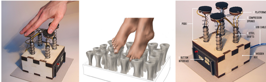
Figure 2. Tangible Pods concept and full functional prototype

The TP consists of multiple “pods” that form a surface and can be physically manipulated/sculpted to create input data. It is a flexible interface that can be used in a range of applications including music, 2-D and 3-D modeling (Figure 2).